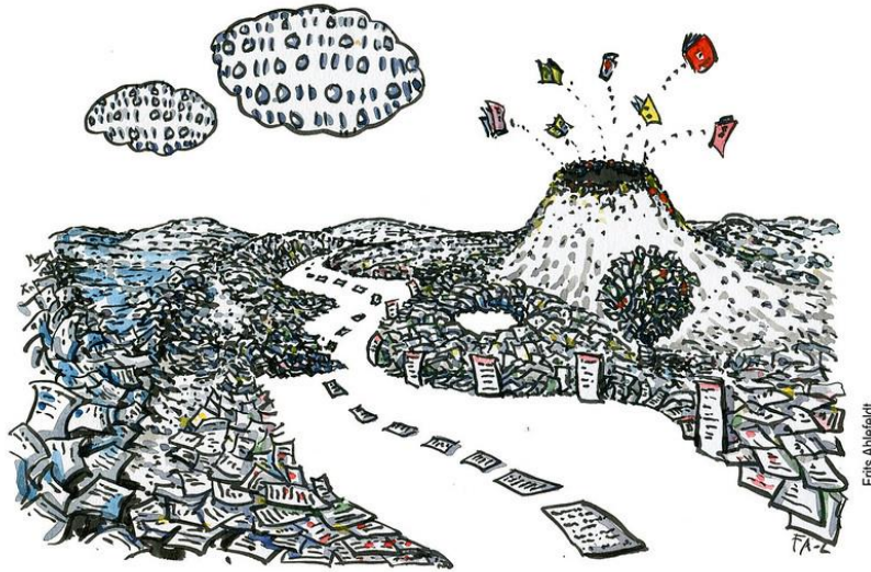
Information landscape with information clouds, sea-waves, roads, waterhole, tree and volcano